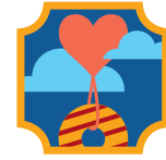
My Cookie Business Resume