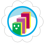
My First Cookie Business

2. Earn one of the Cookie Business badges to help you discover new skills. Each badge has digital marketing skills built right in.