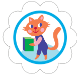
Cookie Goal Setter