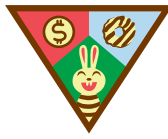
My Cookie Customers