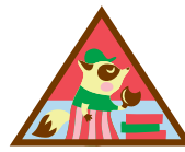
Cookie Decision Maker