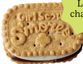
Girl Scout S'mores®

Crispy lemon flavored cookies with inspiring messages to lift your spirits